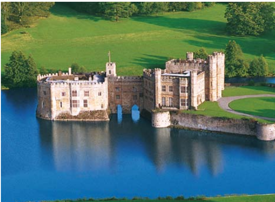
Leeds Castle, near Maidstone, the magnificent setting for our 21 August concert.