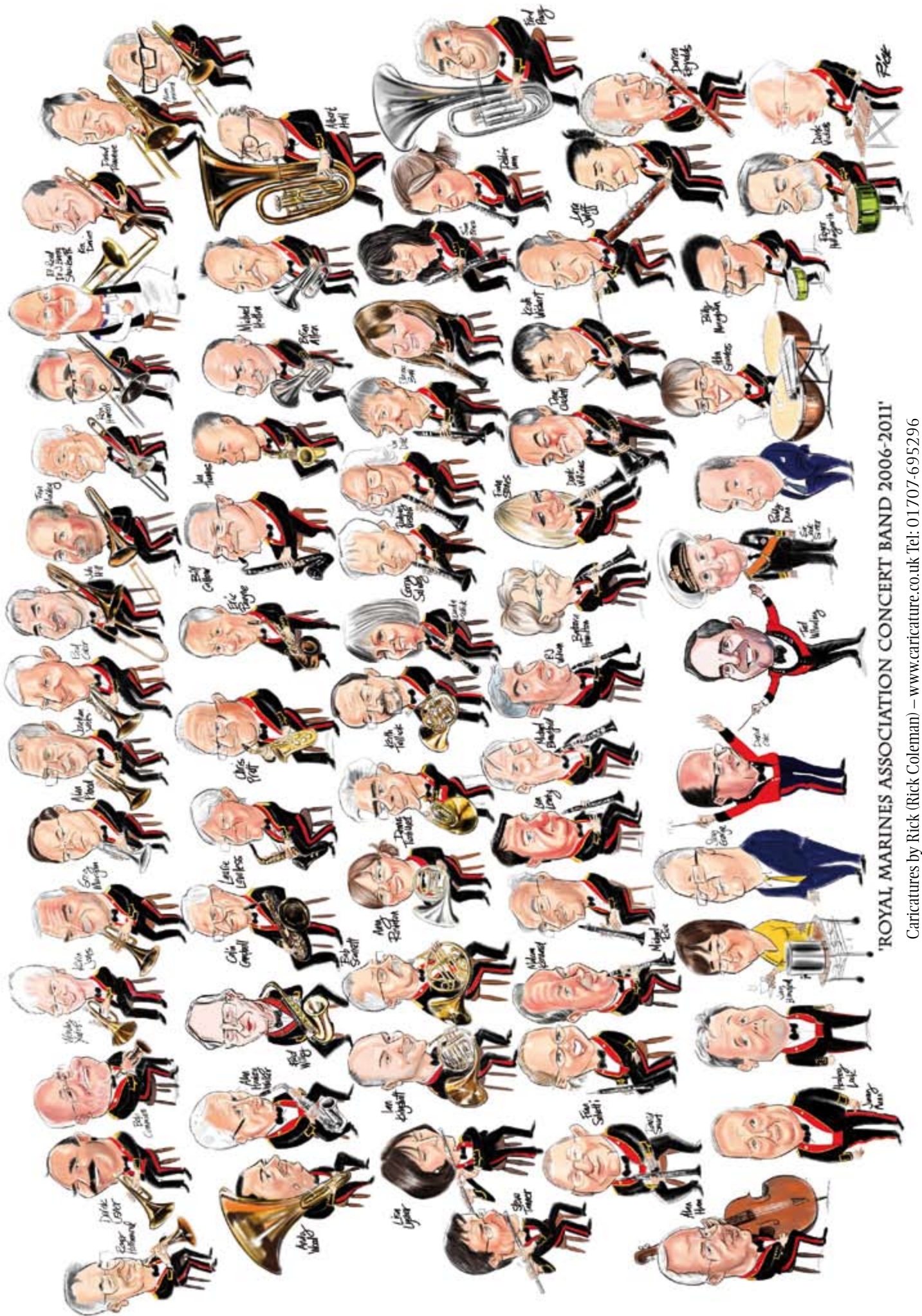
'ROYAL MARINES ASSOCIATION CONCERT BAND 2006-2011'